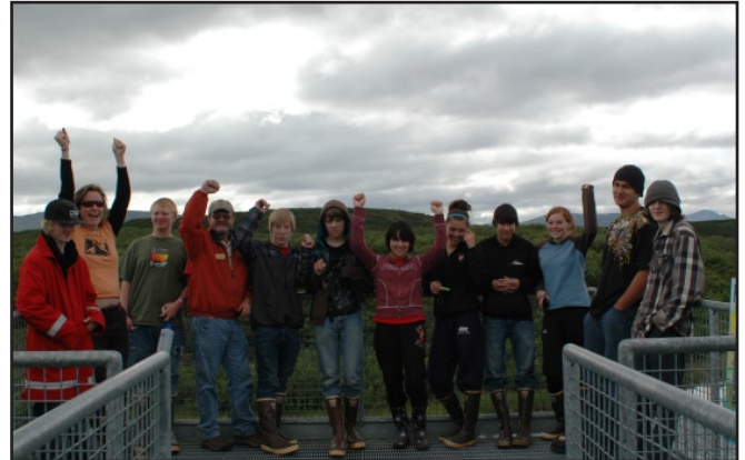
Participants from the 2011 Copper River Stewardship Program gather near Summit Lake at the headwaters of the Copper River.

The Copper River Watershed Project, Prince William Sound Science Center, Wrangell Institute for Science and Environment, BLM, National Park Service and the US Forest Service are joining together for the 2011 Copper River Stewardship Program. Ten students from throughout the Copper River watershed are being recruited to participate in this 10-day adventure through their region. The goal of this project is to engage future leaders of the region in an active exploration of their surroundings to learn about the history, ecology and future challenges facing the watershed and the wild salmon upon which you and your communities depend.