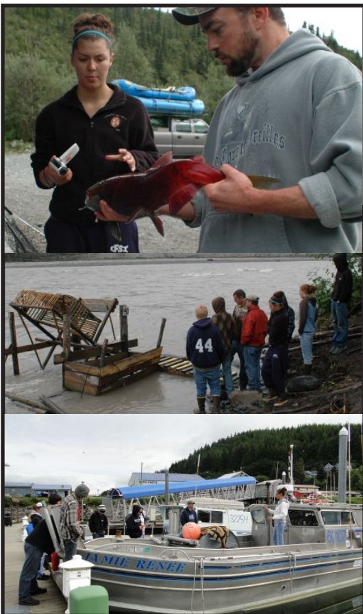
Participants learn about the similarities and differences between up and downriver cultures, fisheries and way of life.

Highlights for the coming summer include: